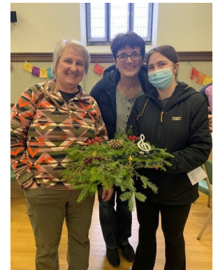
Photos from our Advent wreath-making activity on November 27.